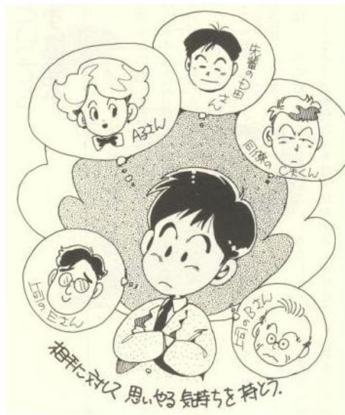
SKSH 2000: 5 Illustration HERE

The acceptance and integration of such differences rather than the creation of a standard "company personality", is thus the guiding principle both for success as an individual as well as for the thriving of a group or company. A "worst case" is when an individual is not able to relate to others (Uchida 1990: 8). Instructions for uniform external signals of communication—for instance, being "cheerful and frank" ( akaruku sotchoku )—do not imply the absence of differences, but, on the contrary, serve to integrate and channel differences that are taken as the given reality.